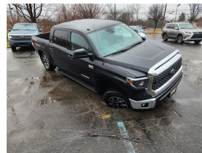
FOUND COLLAPSED CATCH BASIN