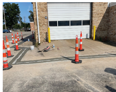
TRENCH DRAIN INSTALL