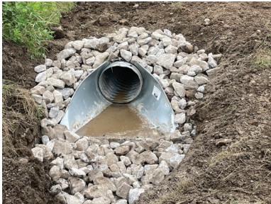
AFTER: CLEARED, POND DROPPED 45'