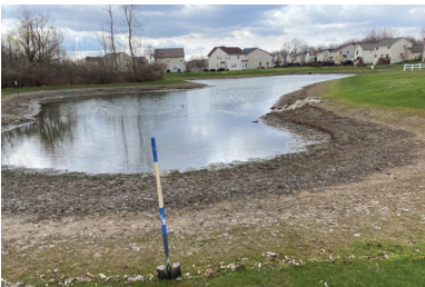
BEFORE: CONTROL STRUCTURE PLUGGED